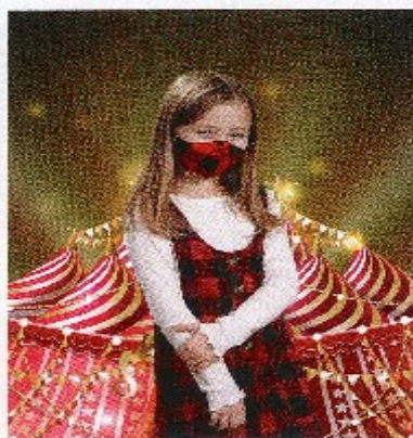
#2102 DEFAULT FOR POSE 2