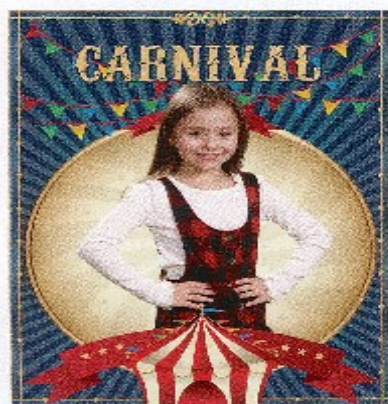
#2101 DEFAULT FOR POSE 1