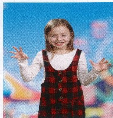
#2105 DEFAULT FOR POSE 3