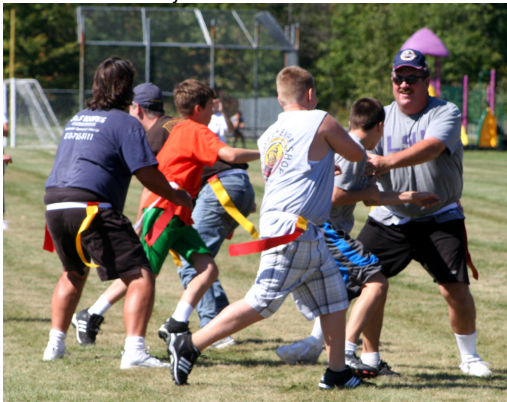
Fighting for their teams.

On Saturday, as our boys had a "bye," they took on their dads in a scrimmage! It was a perfect day for football—and our scout reports that the dads just barely won (and worked HARD for their points:) 13-12. We hear everyone had fun!