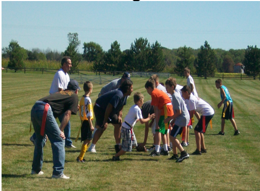
Dads—you should be worried!