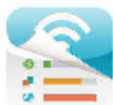
My Data Manager

Every year in early October, all students in the Archdiocese of Detroit take the Iowa assessments for English, Reading, Mathematics, Science and Social Studies. These nationally-normed assessments provide scores for each student along with the comparison score for all of the students at our school, all of the students in our region, and all of the students nationally. Students have a report that lets them and their parents know exactly what proficiencies they have mastered and what they still need to master and where they are in comparison with other learners in the diocese, state, and nation. At Holy Cross, our teachers also give the DRA and Gates MacGinitie assessments to provide even more data to inform students regarding what each one's unique mastery is and what each one's learning needs are.