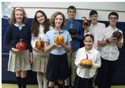
(some of the student artists who painted those cute table decorations!!)

Thank you to everyone who worked to make this weekend celebration a success! Special thanks to the parish's maintenance staff, who haul in and then return extra tables, chairs, food serving stations (and who knows what else), and clean both before and after the event. It is a huge undertaking, and we send our appreciation for their extra labors. Thank you, too, the parish's office staff, who deal with preparation logistics, raffle licensing, phone calls, advertising, money handling, and more. From volunteers to "professionals"--thank you, one and all!