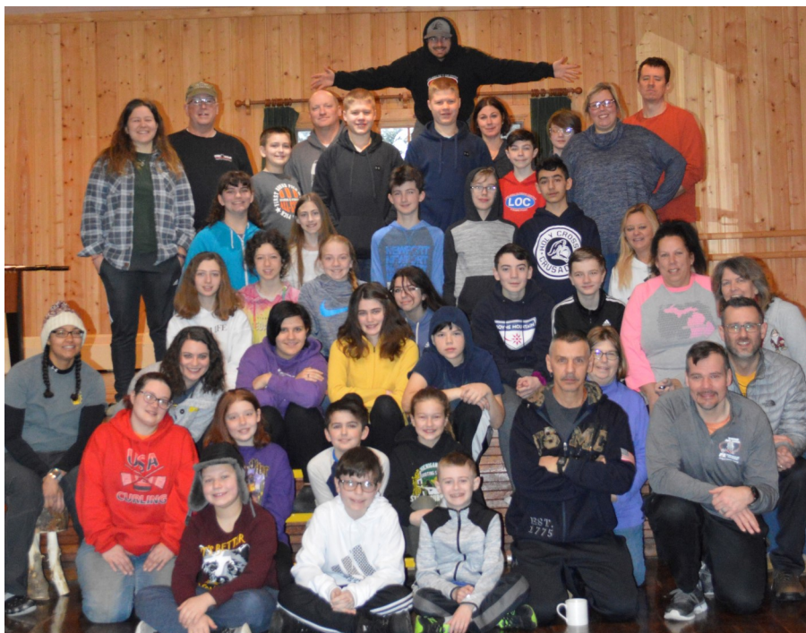
The Holy Cross 2020 camp group!